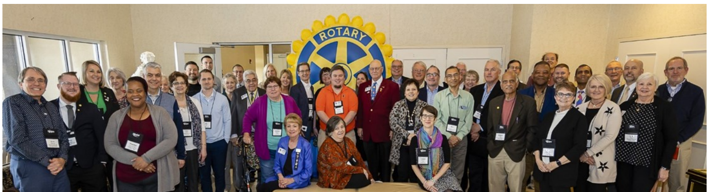
Presidents-elect, presidents-nominee, assistant governors, and District 6490 leaders at PETS in Effingham.