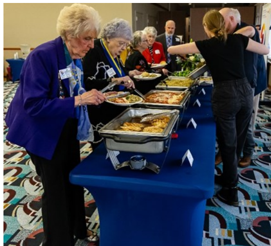
Attendees enjoyed a wonderful buffet of orange chicken, wild rice, broccoli, stuffed spinach pasta, and rolls. Salads and mini-desserts were plated on the tables.